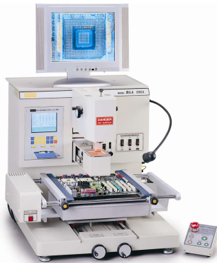
Fonton 936-USB Lead Free Rework Station