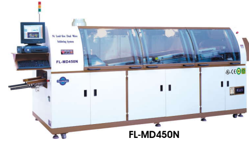
FL-MD450N No. 1 Flow Soldering System

DNA Automation Ltd. Are now the UK's sole distributor for Folungwin are very excited to introduce this High Performance to the UK Market.