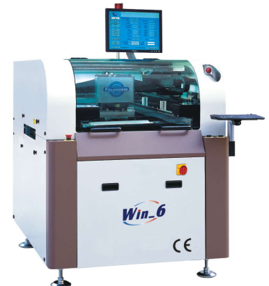
Win_6 Fully Automatic In-Line Printer