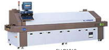
FL-VP1060 Forced Air Convection Reflow