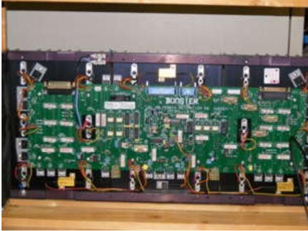
Booster Board Complete with Heat Sink Assy.

Unit 8, 72 Boston Road, Leicester, Leicestershire, LE4 1HB. Tel: +44 116 229 3080 Fax: +44 116 2351844 Registered in the UK No: 6190555 Vat Number 896 7363 57