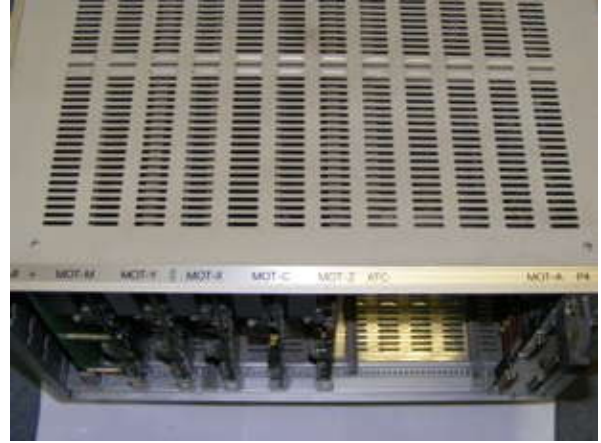
Complete Card Rack including Motor controllers, Vision Card and Feeder Control cards.