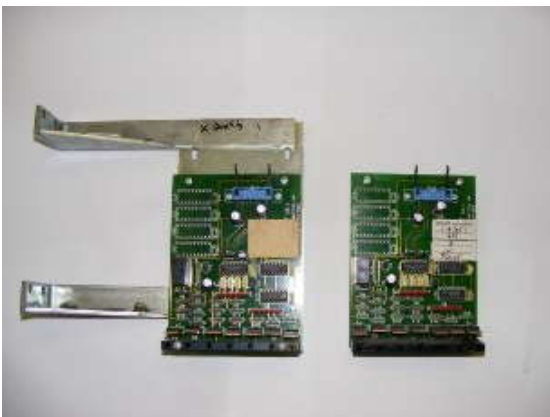
X-Axis Motor Interface cards, these are located on both ends of the X-Axis interfacing the motor and encoders.