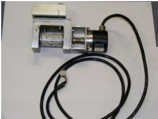
Encoder and Pulley, complete with Bracket, this is found on the Right Hand Side of the X-Axis.