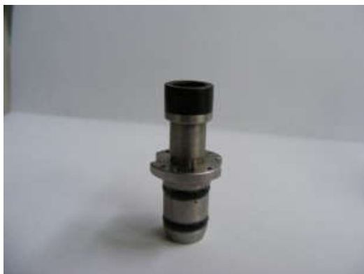
Various Nozzles available, some 100% brand new. Many other consumable parts available, motors, solenoids, valves, O-rings, Chips, cards.