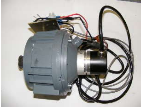
X-Axis Motor Complete with Cable and Molex Connector.